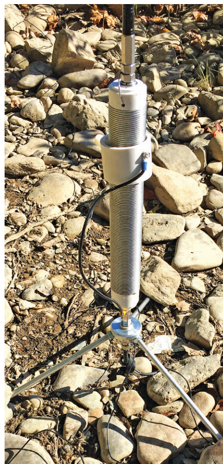
Figure 15 — The SB 1000 TIA kit includes SB 1000 base coil, a small tripod, a 102-inch collapsible whip, and three radial wires.

My top suggestion for improvement is to include a mechanism to allow repeatable tuning. While I recognize that different operating environments will affect the tuning, it would be nice to have a quicker method of changing bands. From an appearance standpoint,