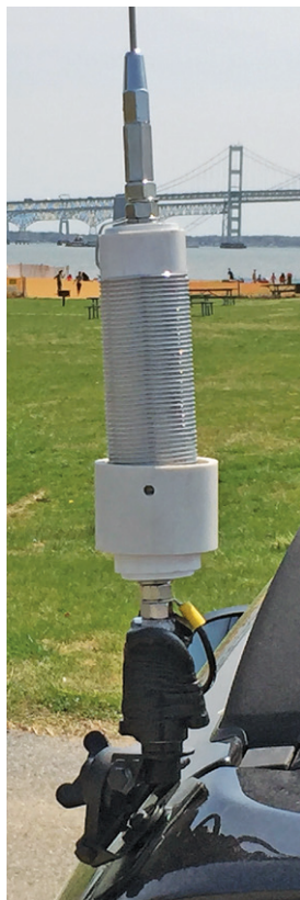
Figure 14 — The SB Mini mounted on a lip mount on the author's Subaru.

Although I could tune the antenna to resonance on each band, one criticism is that there is no definitive way to move the collar to repeatable stops (tuning for 40 meters, 20 meters, and